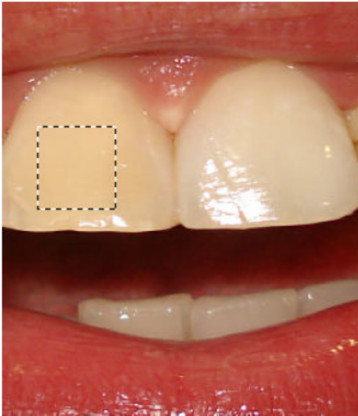
Fig. 1: The area of upper right central incisor which used in photometric evaluation before bleaching