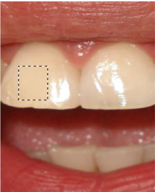
Fig. 2: The area of the bleached surface of the upper right central incisor which used in luminosity measurement

The Adobe® Photoshop® 6.0 computer software has been used for the evaluation of the tooth luminosity on serial digital photographs of initially effective 6.000.000 pixels and high sensitivity (ISO 1000). According to the data which processed on the software the enamel luminosity was slightly increased after whitening.